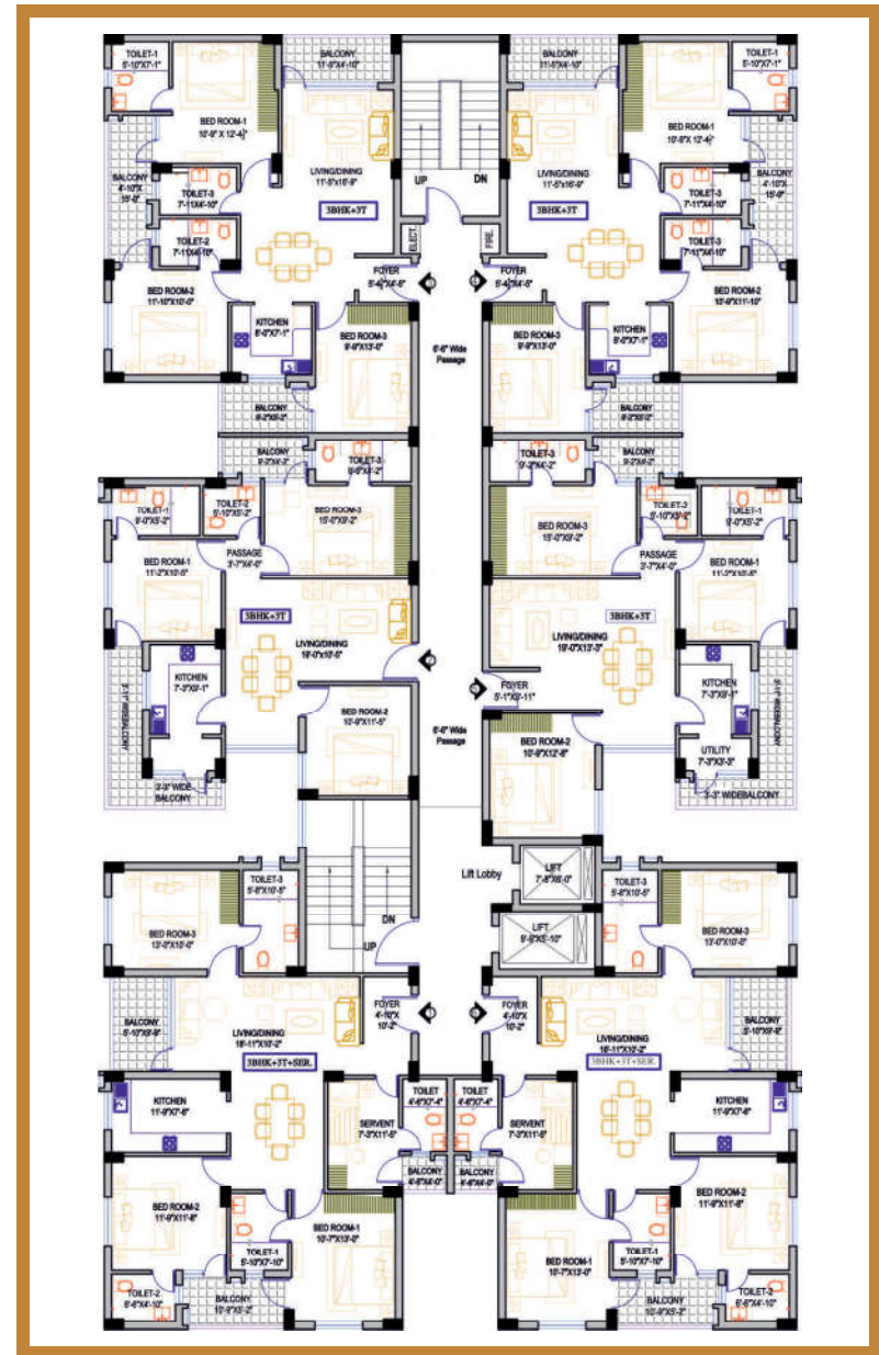
1 + 13 FLOOR